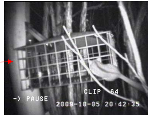
LBP entering feed station

Where to go: Gerraty's Carpark Lake Mountain. The feed will be kept at the Lake Mountain Resort. Entry to the park is free, but your car registration needs to be recorded with the Volunteer Feeding Fieldwork Coordinator/s (details following page) prior to days attendance.