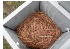
Nestbox with LBP nest & at Lake Mountain checking a box.