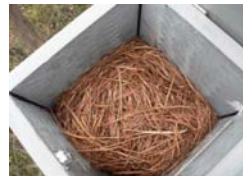
Nestbox with LBP nest & at Lake Mountain checking a box.

Meeting details for both days: Lake Mountain carpark. Time: TBC, but early as all day events.