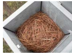
Nestbox with LBP nest & at Lake Mountain checking a box.

Meeting details for both days: Lake Mountain – Gerraty's carpark. Time: TBC, but early as all day events.