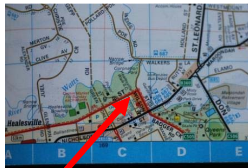
Meeting location Melways 270 C12